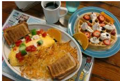
A Greek omelette with spinach, tomato and feta cheese, served with hash brown potatoes, and at right a waffle with strawberries, served with whip cream and pecans, at the Cortez Cafe.

The breakfast menu is large and includes the usual suspects, and a "specials board" lists that day's best. Eggs Benedict, plate-sized pancakes and four-egg omelets are the big stars.